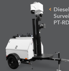
< Diesel-Powered Surveillance Trailer PT-RD6000

Packetalk's trailers provide remote site monitoring with real-time surveillance in high definition video.