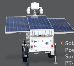
< Solar or Engine Powered Surveillance Trailer PT-RD5000