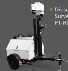
< Diesel-Powered Surveillance Trailer PT-RD6000

Packetalk's trailers provide remote site monitoring with real-time surveillance in high definition video.