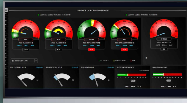
Activity displays & Business rules are customizable to fit agency goals