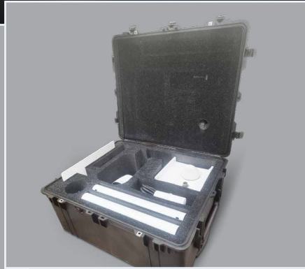
Extension options are available if additional radio or camera height is required

All RD Series components include rugged carrying cases to facilitate transporting the camera system to the next required site. The quick connect assemblies and preconfigured components make set up and breakdown of the system quick and easy. You essentially apply power, aim radios, and watch video.