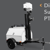
◀ Diesel-Powered Surveillance Trailer PT-RD6000